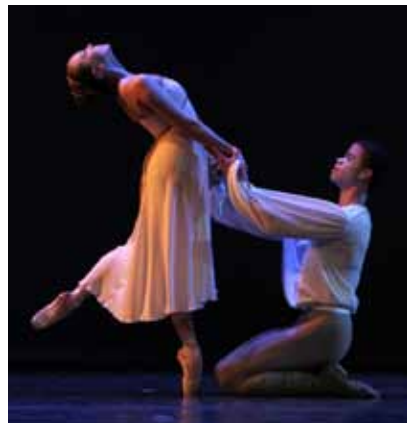
Romeo & Juliet