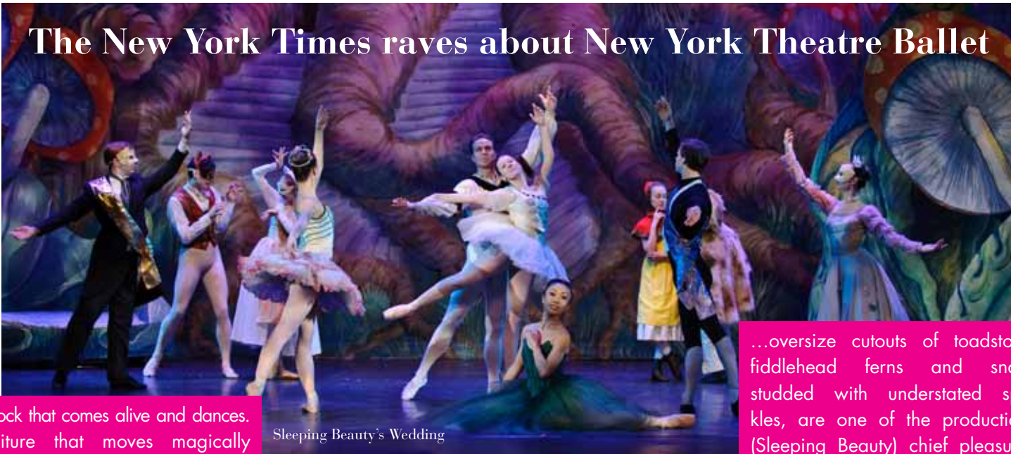
Sleeping Beauty's Wedding